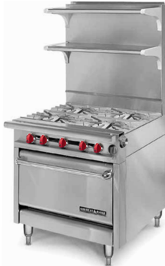
Model Shown HD34-4-I